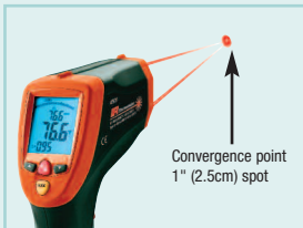
Two laser points converge at a distance of 50"/(127cm) and form a 1" (2.5cm) spot.