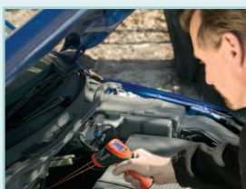
Max hold indicates and holds the peak temperature for easy identification of hot spots