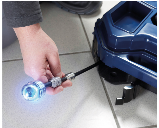
The 30 m camera rod is at the same time flexible and durable because of its construction