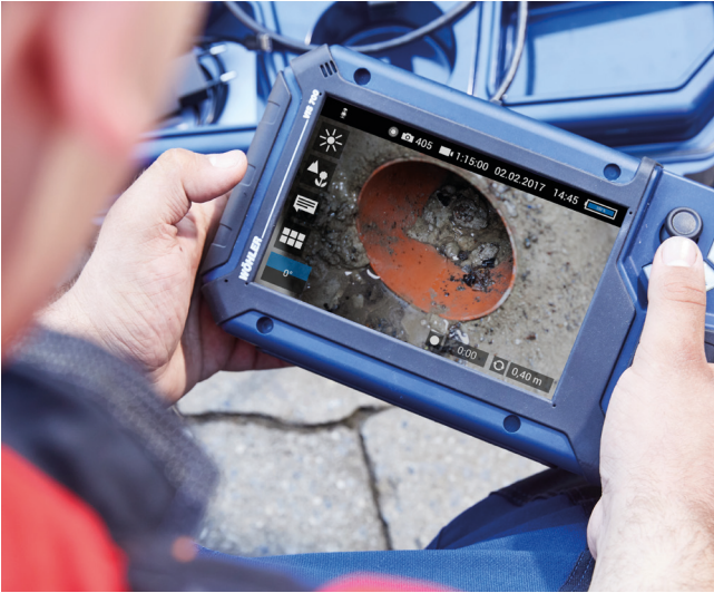
Sharp picture, clear menu and comfortable to hold