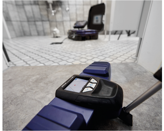
Precise location of the camera head with the Wöhler L 200 Locator