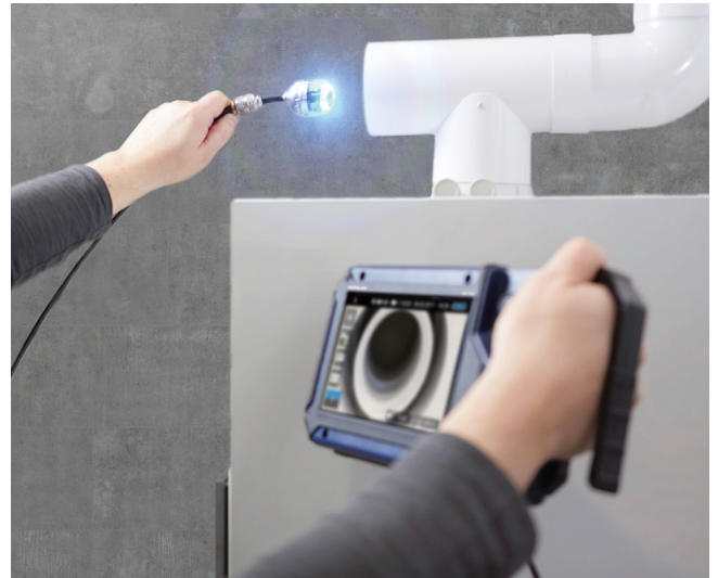
Inspection of flue gas lines from Ø 56 mm: easily negotiates tight bends of 87°