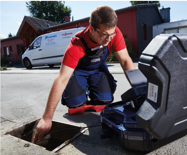
Secure drain inspection with the waterproof camera head