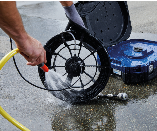
Fast cleaning for lasting hygiene: Simply splash the robust case and the viper with water.