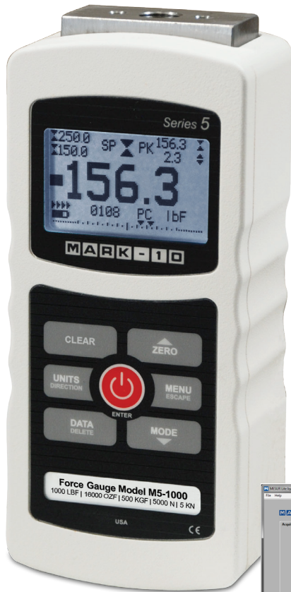
MESUR™ Lite data acquisition software is included with the gauges

The M5-750, M5-1000, M5-1500, and M5-2000 advanced digital force gauges are designed for tension and compression force testing in numerous applications across virtually every industry, with capacities up to 2,000 lbf (10,000 N). The gauges features an industry-leading sampling rate of 7,000 Hz, producing accurate results even for quick-action tests. A large, backlit graphics LCD displays large, legible characters, while the simple menu navigation allows for quick access to the gauges' many features and configurable parameters. Data can be transferred via USB, RS-232, Mitutoyo (Digimatic), or analog outputs.