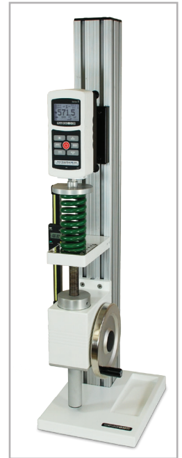
Shown with a TSF test stand in a spring testing application

The gauges' averaging mode addresses the need to record the average force over time, useful in applications such as peel testing, while external trigger mode makes switch activation testing simple and accurate. An ergonomic, reversible aluminum design allows for hand held use or test stand mounting for more sophisticated testing requirements. The force gauges are directly compatible with high capacity Mark-10 test stands, grips, and software.