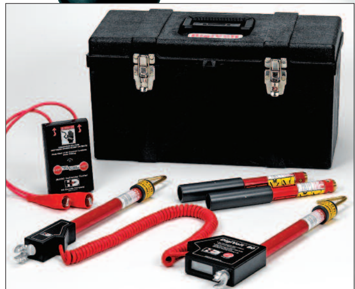
DVM-80 Kit with PT-5000B Proof Tester® and pair of R-80 add-on resistors