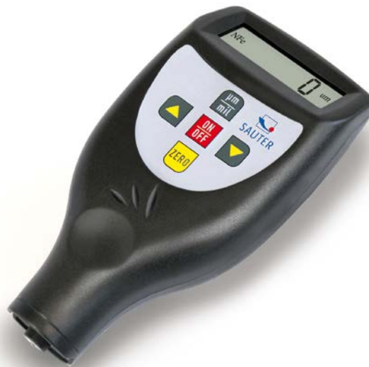
Illustration: TC 1250-0.1FN