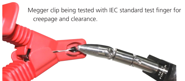
Megger clip being tested with IEC standard test finger for creepage and clearance.