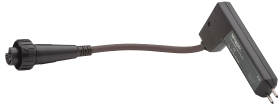
DTP1-C Duplex Twist Probe 1 - Connect Order part number: 1006-449