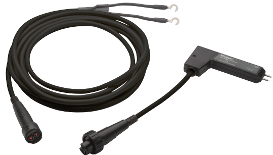
6m / 20' version of DH1-C above but only 1 included Order part number: 1006-443