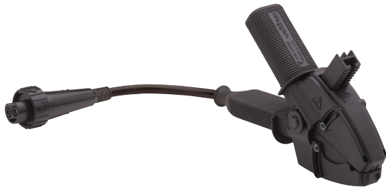
KC2-C Kelvin Clip 2 - connect Order part number: 1006-451