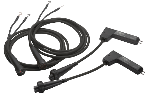
3M Duplex Handspike lead set, with connect (x2) Order part number: 1006-442