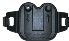
Aspirator plate Sample atmosphere prior to entry