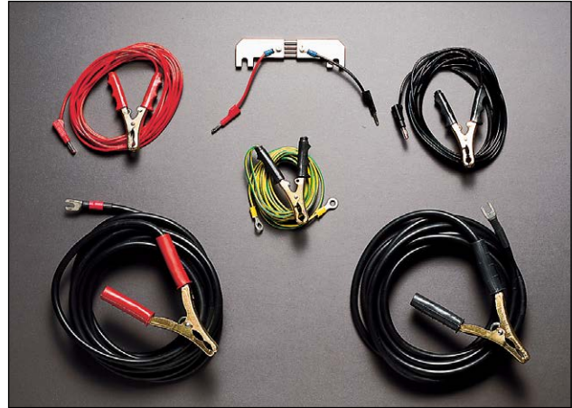
Cable set GA-02053, GA-00200 and shunt BD-90022.