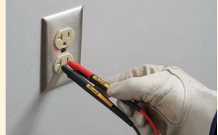
Increase tip exposure for CAT II probing