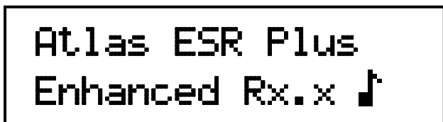
Audible Alerts Enabled

The audible alerts can be turned on or off, the current status of which is shown on the start-up screen (when powering up the unit from off).