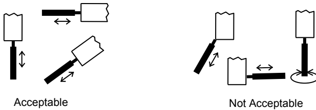
Figure 1 – Correct and Incorrect Angles of Measurement

Note: The sensing head with adapter must be in line with the object being measured. Avoid rotating the sensing head. Refer to the figure below.