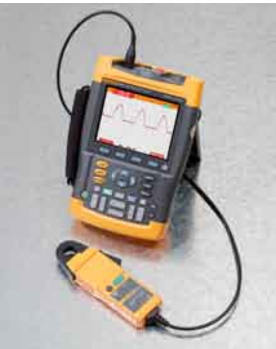
i30s connected to a Fluke 199C ScopeMeter.

Ordering information i30s AC/DC Current Clamp