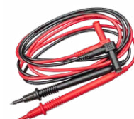
Test lead with probe for CMM/CMP (set) WAPRZCMP1