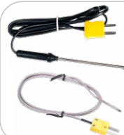
Temperature measurement probe (K-type, bayonet) WASONTEMP probe (K-type, metal) WASONTEMK2