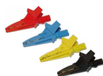
Crocodile clip red / blue / yellow / black WAKRORE20K02 WAKROBU20K02 WAKROYE20K02 WAKROBL20K01