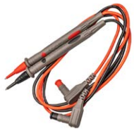
Set of test leads CAT IV, M WAPRZCMP2