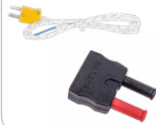
Temperature measurement Probe (K-type) WASONTEMK Adapter WAADATEMK