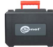
Carrying case WAWALM3