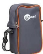
M13 carrying case WAFUTM13