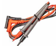
Set of test leads CAT IV, S WAPRZCMM1