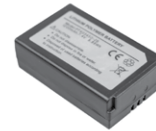
Li-Pol 7.4 V 1200 mAh rechargeable battery WAAKU30