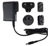
Battery charger power supply WAZASZ26