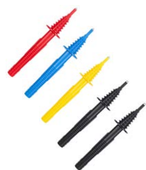
Pin probe (banana socket) red / blue / yellow / black B1 / black B3 WASONREOGB1 WASONBUOGB1 WASONYEOGB1 WASONBLOGB1 WASONBLOGB3