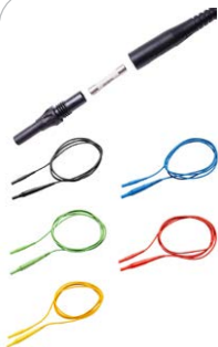
Test lead 2 m with 10 A fuse CAT IV 1000 V black / blue / green / red / yellow WAPRZ002BLBBF10 WAPRZ002BUBBF10 WAPRZ002GRBBF10 WAPRZ002REBBF10 WAPRZ002YEBBF10