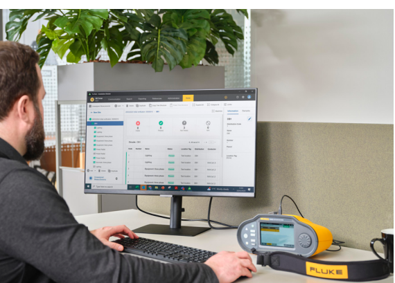
TruTest Software simplifies electrical system data management and reporting