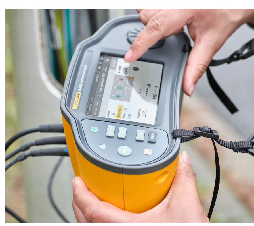
Full-color touch screen and tactile rotary knob for fast navigation

With the 1670 Series, you'll be able to perform your required testing faster and reduce the time you spend on documentation, all while having the ultimate confidence in the data you're collecting.