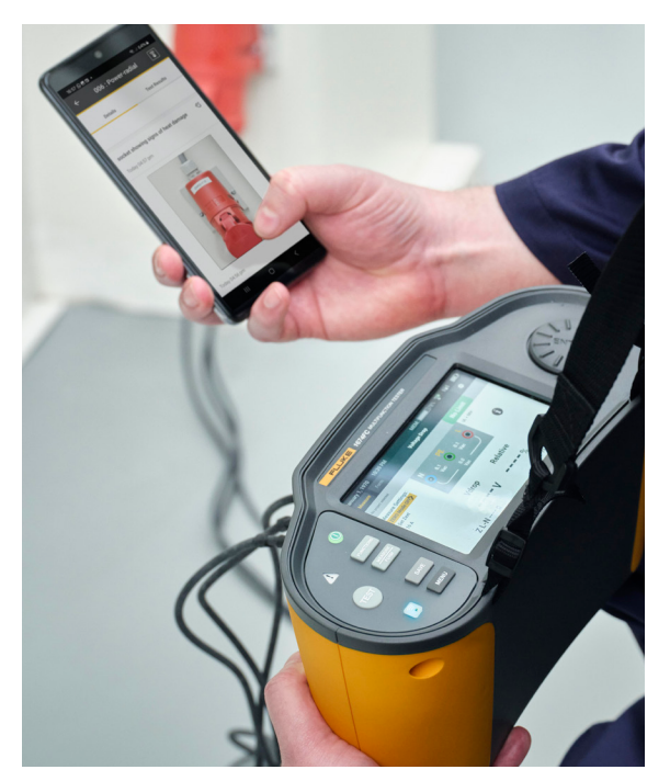
Assign photos directly to specific test points for more detailed documentation