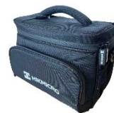
HM-SP01-POUCH M/G/SP Series Pouch