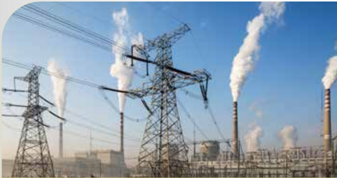
Electricity generation (coal-fired power plants, gas-fired plants, hydroelectric plants, etc.)

This multimeter guarantees excellent measurement reliability, electrical safety in your work and higher productivity in your activity.