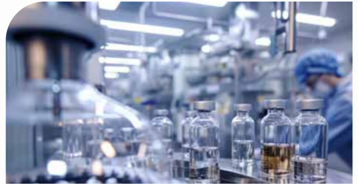
Process industries (chemicals, pharmaceuticals, cosmetics, etc.)