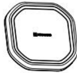
MIC protective case (X1)