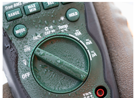
Double molded for rugged waterproof (IP67) protection

See next page for product specifications and ordering information