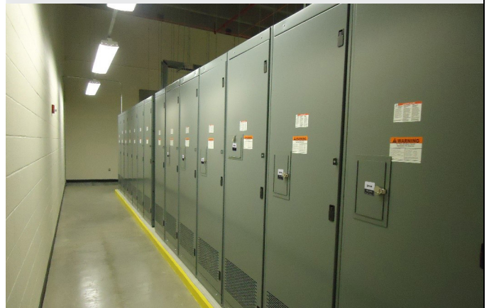
Figure 3: Finished installation of IR windows

For more information about FLIR in electric power distribution or to schedule a product demonstration visit: www.flir.com/ir-windows