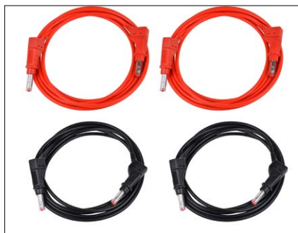
Test lead set, 4 x 2 m (6.5 ft) GA-00082