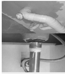
Water Supply Pipe Leakage/ Water Pipe Leakage