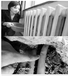
Heating Pipes/ Underfloor Heating Pipe Leaks