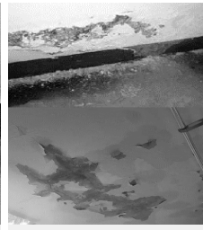
Roofs And Walls, Water Seepage In The Ground