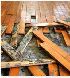
Leak Under The Floor