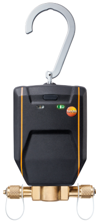
testo Smart Valve