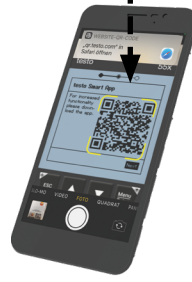
testo Smart App