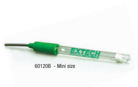
60120B - Mini size