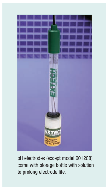
pH electrodes (except model 60120B) come with storage bottle with solution to prolong electrode life.